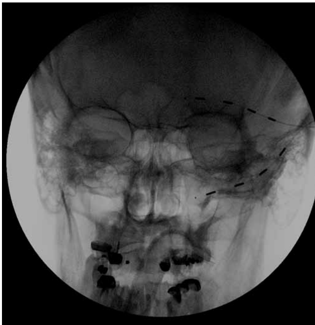
Fig. 1. Anteroposterior fluoroscopic radiograph of Case 1 showing placement of 2 quadripolar electrodes in the left supraorbital and infraorbital positions.

intervention at that time included enucleation of the left eye and a replacement with a prosthetic eye. Subsequently, the patient developed chronic pain over his left face. He underwent 7 operations on the eye with no significant relief in pain. On presentation to our clinic he reported 10/10 pain on a visual analog scale (VAS), which was described as sharp and shooting in the V1 and V2 nerve distribution. His medications included fentanyl patch, oxycodone, gabapentin, and oxcarbazepine, which only provided minimal symptomatic relief. He had also tried alcohol injections, which provided no benefit. After a 10 day PNS trial of the supraorbital and infraorbital nerves, the patient returned to the clinic and reported significant improvement in pain relief. He was subsequently implanted with 2 percutaneous linear quadripolar electrodes in the left V1 and V2 regions that were connected to a RestoreUltra pulse generator (Medtronic, Minneapolis, MN) which was implanted in the left infraclavicular subcutaneous space (Fig. 1). The implanted stimulator was programmed with a pulse width of 390 microseconds and a rate of 40 Hz. The electrode polarities were set to positive in the 0 and 3 positions and negative in the 1 and 2 positions. The patient obtained excellent pain control (0/10 on VAS). The only noticeable side effect reported was occasional