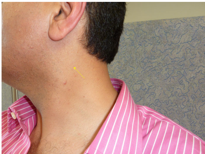
Figure 1. On surface anatomy, GAN emerges onto the anterior surface, approximately at one-third the distance from either the mastoid process or the external auditory canal to the clavicular origin of the sternocleidomastoid (SCM), irrespective of the neck length.